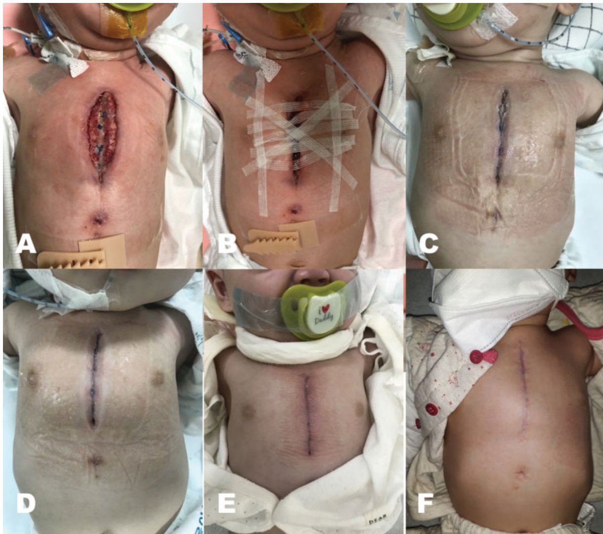
Fig. 4 Noninvasive and serial wound approximation of pediatric sternotomy wound dehiscence. Representative case of patient no. 4. (A) This patient was treated with conventional vacuum-assisted closure for 10 days before referral to the plastic surgeon. Wound margins were widely separated, although healthy granulation tissue was formed in the wound bed. (B) Wound margins were elevated and everted from the wound bed under mild sedation and local anesthesia, and then serial approximation was started; (C) 14 days after treatment; (D) 20 days after treatment, the last day of negative pressure wound therapy; (E) 30 days after treatment; (F) 5 months follow-up.

margins from the wound bed using a Freer elevator, and then resumed the serial approximation. DeFazio et al 17 also witnessed this problem and combined bridging retention sutures with NPWT to achieve progressive tissue retraction over time and guide dermal approximation while minimizing the volume of sponge required to fill the three-dimensional cavity. Although the technical details are different, our concept is similar in that we also simultaneously pursue wound decontamination, reduction of dead space, and marginal apposition. Judicious use of the early serial approximation technique can yield superior aesthetic results than secondary intention healing. In particular, it excludes the necessity of surgical procedures for definitive closure in many SWD, SSWIs, and selected “superficial” DSWIs in pediatric SWC patients. It would be the best to start at the early resilient wound period for maximum benefit, when adhesion and wound contracture have not yet been estab-