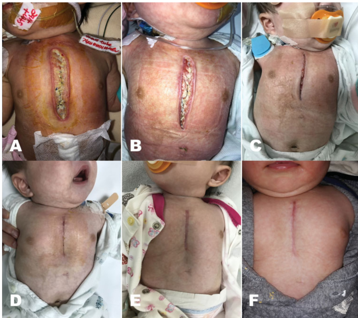
Fig. 3 Noninvasive and serial wound approximation of pediatric sternotomy wound dehiscence. Representative case of patient no. 5. (A) Initial wound presentation on postoperative day 11, first day of wound approximation and negative pressure device application; (B) 11 days after treatment; (C) 20 days after treatment; (D) 41 days after treatment, the day of hospital discharge; (E) 2 months after treatment, at the outpatient clinic; and (F) 5 months follow-up.

The inner silicone wound contact layer does not lead to ingrowth of the granulation tissue into the dressing, which alleviates the pain and discomfort during dressing changes, and therefore is another specific benefit in the pediatric population. Its connecting tube is integrated on the top surface of the dressing without any particular pressure area so that no specific effort is required for proper tube placement.