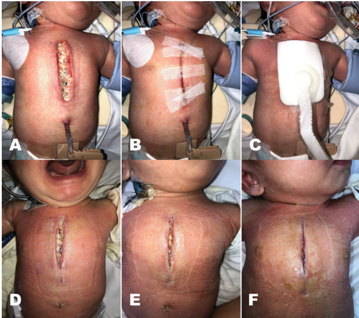
Fig. 1 Noninvasive and serial wound approximation of pediatric sternotomy wound dehiscence. (A) Minimal bed side debridement was performed for easy approximation. (B) Wound was approximated with adhesive skin tapes. (C) Single-use negative pressure device was applied on the approximated wound. (D–F) Seven, 14, and 21 days after first single-use negative pressure device application (patient no. 6).

Since 1997, when Argenta and Morykwas 4 announced the usefulness of vacuum-assisted closure (VAC) in wound care, this innovative dressing has been widely used in a variety of acute and chronic wounds, including poststernotomy wounds. Agarwal et al, 5 one of the earliest groups that introduced VAC as the first-line therapy for sternal wound management, applied it to SWD as well as SSWI and DSWI to emphasize the efficacy of VAC as both, sole and adjunctive therapies, in complex sternal wound management. Bakaen et al 6 demonstrated the safety and effectiveness of negative pressure wound therapy (NPWT) in noninfected open chest management with potential to improve outcomes. Phoon and Hwang 2 emphasized that NPWT plays an important role in the management of DSWI and mediastinitis.