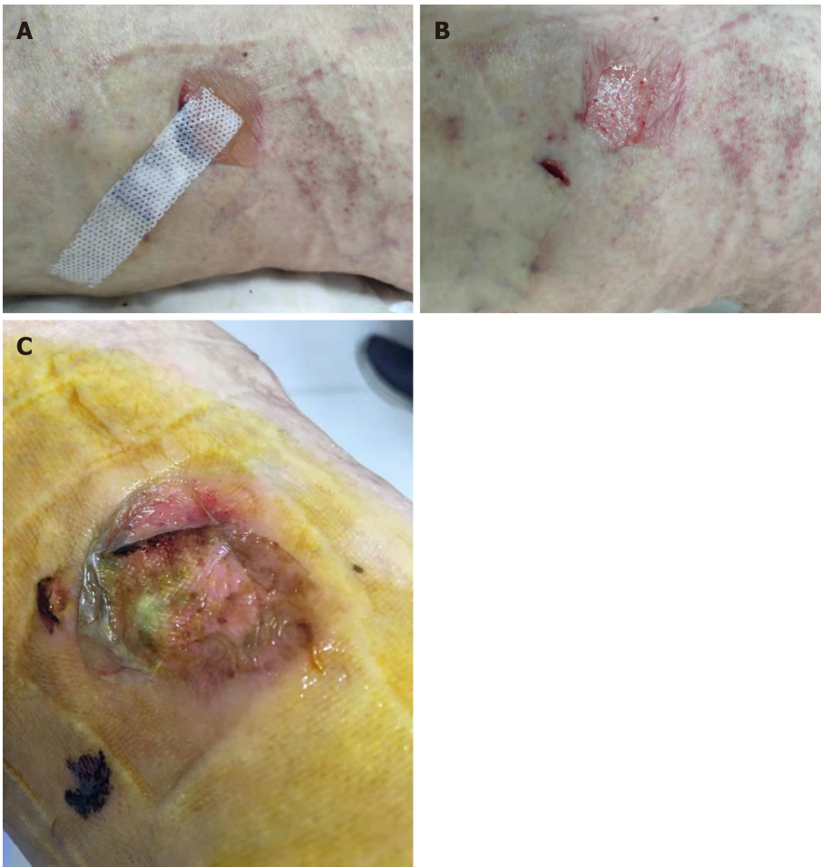
Figure 1 Patient received minimally invasive surgery for varicose veins, the small incision was closed by adhesive strap on November 4, 2019. A: An allergic blister was found on postprocedure day 4; B: The skin was peeled while removing the strap; C: The wound was unhealed on November 12, 2019 as the patient failed to follow-up on schedule for wound care.

The first-line treatments of CVLUs are bed rest with leg elevation, wound care, debridement, and compression. Surgical approaches remain a high ligation with or without stripping or ablation of the great saphenous veins (GSVs) depending on venous reflux or insufficiency; not all CVLUs are suitable for surgery due to comorbidities [1,2,8] . Standard wound care should be used for an initial period of 4 wk and can fail to heal approximately 25% of CVLUs. Even advanced therapies do not heal > 60%. Wound failing to heal 50% ulcer area at 4 wk should be reevaluated and then considered for advanced therapies in the absence of underlying disease [3-6] . When standard care of wound for 4 wk failed to heal CVLUs effectively, advanced wound care should be considered to use based on the available evidence. Unfortunately, many advanced approaches for CVLUs do not have strong evidence or a randomized prospective study to evaluate the efficacy.