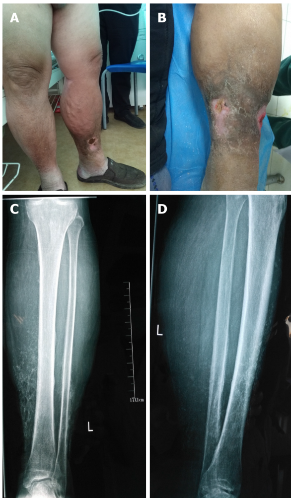
Figure 4 The male patient had varicose vein and venous insufficiency for 15 years and ulcers for 1.5 years. A: Redness, warmth, pain, and edema with two ulcers were noticed on admission; B: The inflation of the skin was relieved after initial treatment; C and D: X-ray showed calcification of the tissue around ulcers.

Besides, the role of povidone-iodine, peroxide-containing products for healing CVLUs cannot be concluded until an additional qualified study is performed [22] .