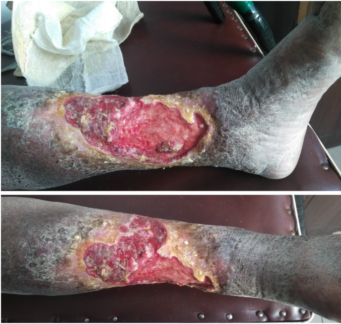
Figure 3 The patient had chronic venous leg ulcers for approximately 20 years. The pathological study of a biopsy from the wound indicated squamous cell carcinoma.

hydrophilic foam can be used for exuding CVLUs. Alginate dressing is suitable for wound with a cavity or complicated ulcers; when it contacts with exudates, a gel will be formed to facilitate wound rehydration [16] . Hydrogel dressing consists of cross-linked insoluble polymers and is easier to remove than alginate dressing and is suitable for dry wounds [17] . Unfortunately, no robust evidence is available to favor one dressing over another for CVLUs [18,19] . It is worthwhile to remind that selection of wound dressings is sometimes influenced by advertisement instead of evidence [20,21] .