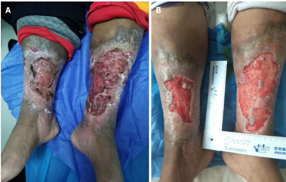
Figure 2 This 70-year-old female patient had suffered from chronic venous leg ulcers on both lower extremities for 40 years. Thirty years ago, a skin graft was harvested from her thigh without any anesthesia expecting for better survival of the graft. Unfortunately, the skin graft failed to grow, and she refused any skin harvest for skin graft. At this current time, her wound was prepared well enough for skin graft. A: Chronic venous leg ulcers on both lower extremities; B: Prepared for skin graft.

process of a sample, or test techniques. A biopsy should be considered for any patients with a history of atypical chronic refractory ulcers to exclude skin cancer ( e.g. , squamous cell carcinoma) [9] (Figure 3). X-ray film may demonstrate if there is an involvement of the bone or inflammation of tissue underneath or around the ulcers (Figure 4). Patients with leg edema, healed or active ulcers, especially with a history of deep venous thrombosis (DVT), should be examined with duplex ultrasound for ilioacaval venous obstruction. Loss of respiratory variation in the common femoral vein or reversed flow in the superficial epigastric vein on duplex ultrasound should be referred for ascending venogram (Figure 5) or computed tomography (CT) to assess the venous insufficiency or valve failure [10-12] . In patients with complicated CLUVs, CT angiography for artery in limbs to confirm the presence and degree of arterial occlusion is a wise choice.