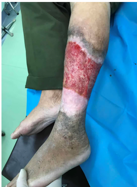
Figure 6 The edge of the ulcer appears white, a sign for the development of granulation tissue. This tissue should be preserved rather removed during debridement.

immunomodulating and anti-inflammatory actions through the inhibition of matrix metalloproteinase provided a possible solution to support wound healing [6] . Another study [29] compared 10 patients who received doxycycline 20 mg twice daily with another 10 patients who received doxycycline 100 mg twice daily; the results indicated that higher dosage may improve the healing rate of recalcitrant leg ulcers [29] . A case-control study showed that topical 0.5% timolol maleate improves the healing of chronic leg ulcers [30] .