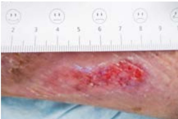
2. 08.11.2013 HydroClean® is removed and changeover to HydroTac® is carried out.