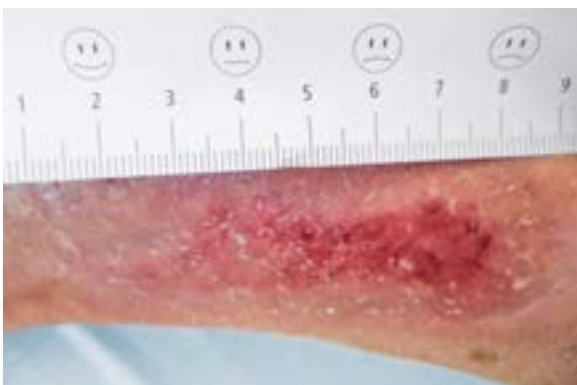
3. 26.11.2013 The aim of the therapy was achieved after changing dressing seven times.